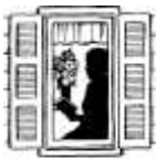
Remember the Homebound

We encourage you to remember our members who are homebound. Show them you care! Send a card or note.